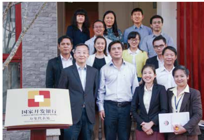
老挝留学生校友与国家开发银行代表在国家开发银行万象代表处合影 Photo of Laos Alumni and CDB Delegates in CDB Vientiane Representative Office