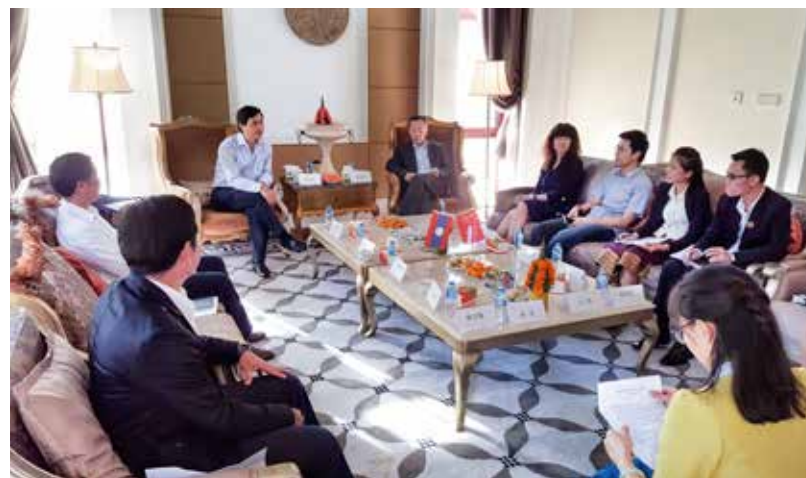
老挝留学生校友座谈会 Laos Alumni Meeting