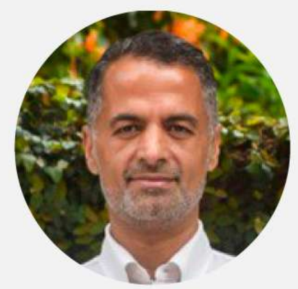
Sunil Babu Pant Founding Member, Blue Diamond Society; Former Congressman, Nepal